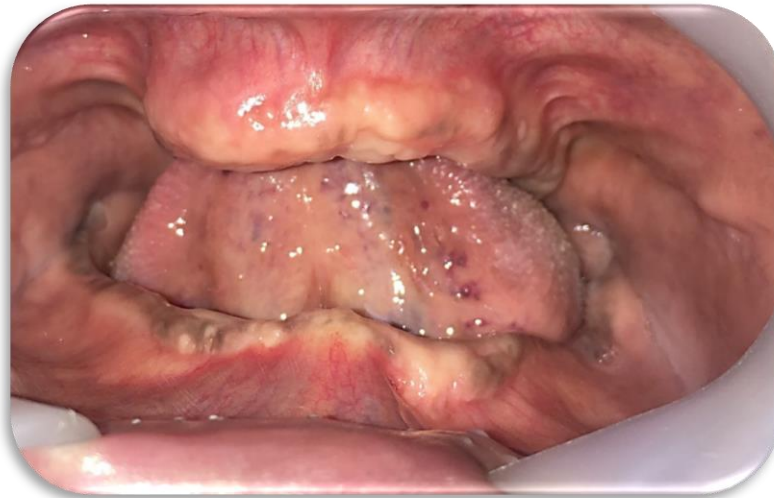
Fig. (1): A patient with completely edentulous arches (mandible & maxilla).