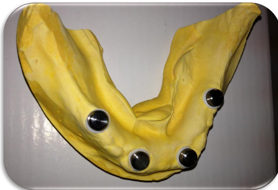
fig.(4c): A stone cast showing; white processing collars with its metal housings accurately fitted on it.