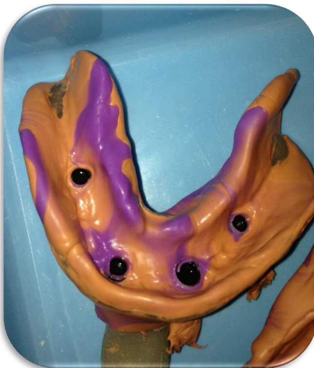
Fig.(4b): A one-step rubber base impression including the metal transfers.