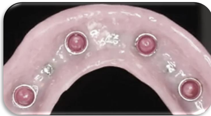
fig.(3c): Finished and polished overdenture containing the male patrices with pink retentive nylon inserts.