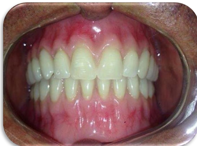
fig.(5): Finished & polished implant-supported overdenture accurately placed in patient's mouth.