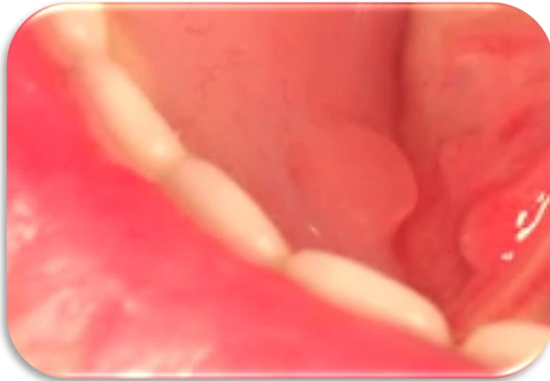
fig.(3b): Excess acrylic resin escaping from lingual holes in the overdenture.