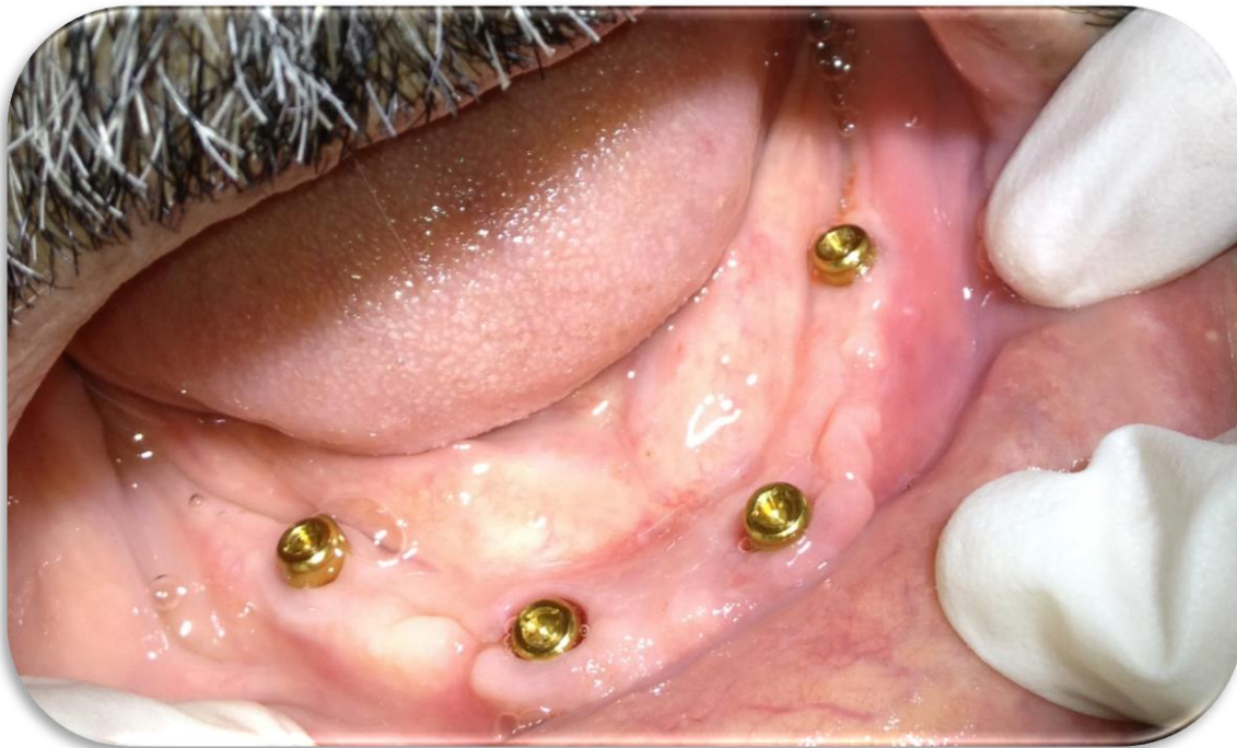
fig. (2): Locator abutments properly tightened onto corresponding implant fixtures.