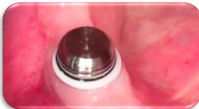
fig.(3a): white processing collars with its metal housings accurately fitted on it.