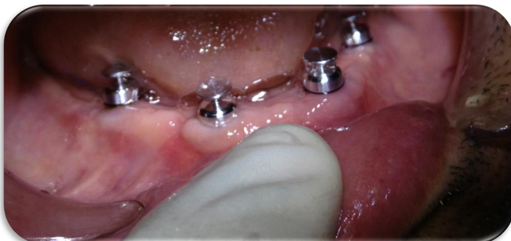
fig.(4a): Metal transfer copings suitable fitted on their corresponding abutments.