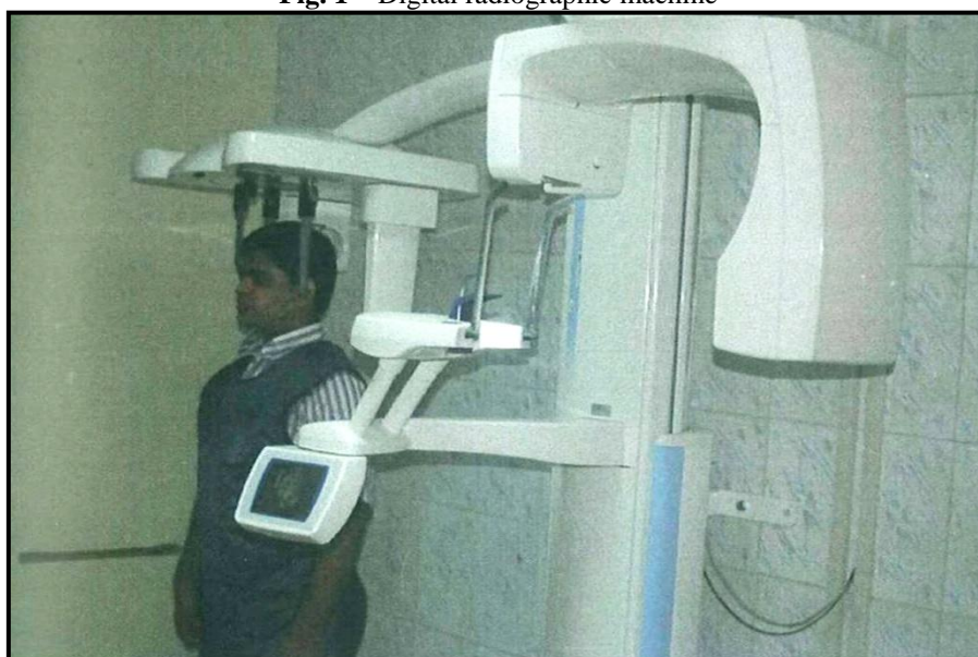
Fig. 1 – Digital radiographic machine