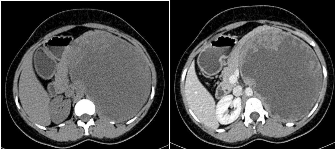
Fig 1 & 2 : CECT axial section showing well defined enhancing mass lesion in lower pole of kidney with solid and cystic components

Patient underwent left sided nephrectomy.(figure 3) specimen sent for Histopathological examination. Post op period uneventful. patient was discharged on fourth post operative day. Cut section of the specimen shows multiple small cystic spaces with greatest dimension being 9 cms, variegated appearance with marked haemorrhage and necrosis. Gerota's fascia and capsule were intact and adrenal gland was not found. 4 cms long ureter was excised along with renal vessels. microscopically tumour was limited to fibrous capsule, it consisted of follicles of varying sizes filled with colloid like material. follicles were lined by cuboidal to columnar cells. nuclei were round to ovoid. Histologic Grade: (Fuhrman's grade) G2: Nuclei slightly irregular, approximately 15 \mu m; nucleoli evident. with above findings, diagnosis of thyroid follicular carcinoma like RCC was made with Primary Tumor (pT): pT2aNoMo with no Lympho-Vascular Invasion. Patient was kept on follow up for 10 months with no evidence of distant metastasis.(figure 4,5 and 6)