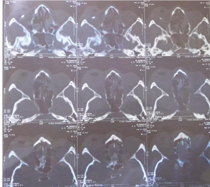
FIG CT Scan showing IOFB.