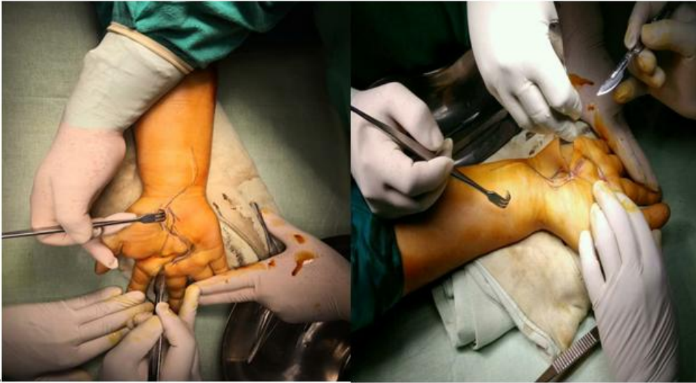
Primary incision along the pre marked site of most prominent part of the swelling.