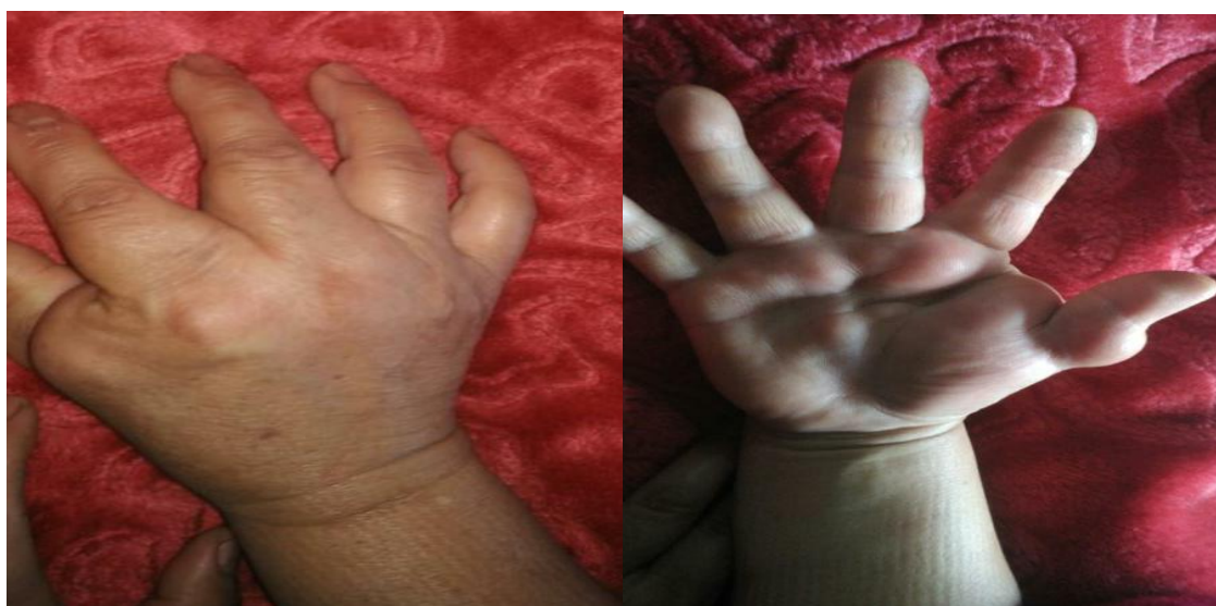
Clinical picture of the swelling over the dorsum and palmar aspect of hand

On examination, a solid mass measuring 2 x 1 cm over flexor aspect of distal forearm, 2 x 2 cm over thenar eminence of hand, 1 x 2 cm over thumb was seen. Mobility was restricted longitudinally but present transversely. Tinel's sign was positive. There was no associated motor weakness, no muscular atrophy, no cutaneous pigmented lesions.