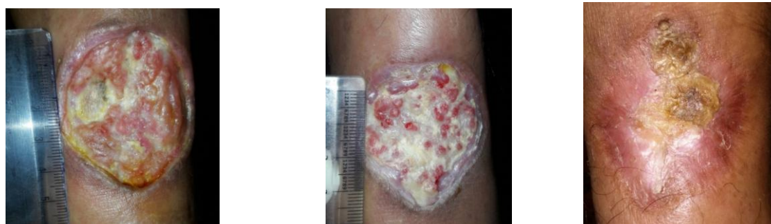
A chronic non healing ulcer at the anterior aspect of leg from 1 year. Final result following 10 PRP applications.