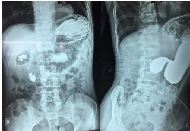
Fig 1: Barium meal series shows narrowing of 2 nd part of duodenum with dilatation of proximal duodenum and stomach