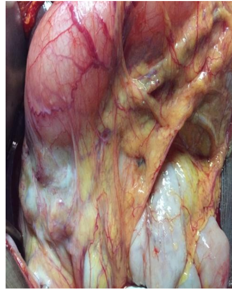
Fig 5: Rim of pancreatic tissue around the duodenum