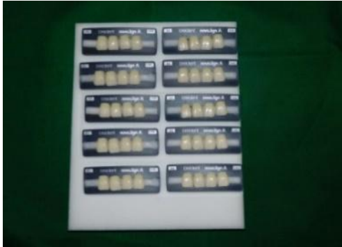
Fig 1 Novolign A Veneers

A = the adhesive area of the veneer (mm 2 ) and were tabulated for both the groups. A sample from each group was then examined under Scanning Electron Microscope (Carl Zeiss, Zigma model) to examine the debonded surface (Fig:6) and analyse the failure type.