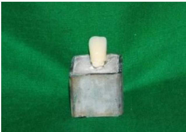
Fig 3 PEEK Framework with Veneer Attached for group A & group B