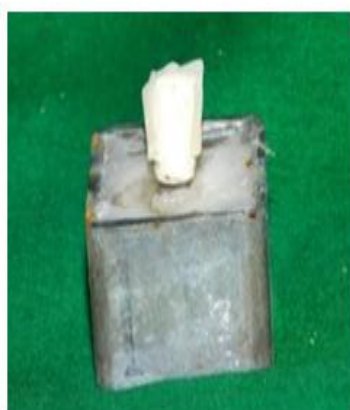
Fig 5 Specimen after Testing