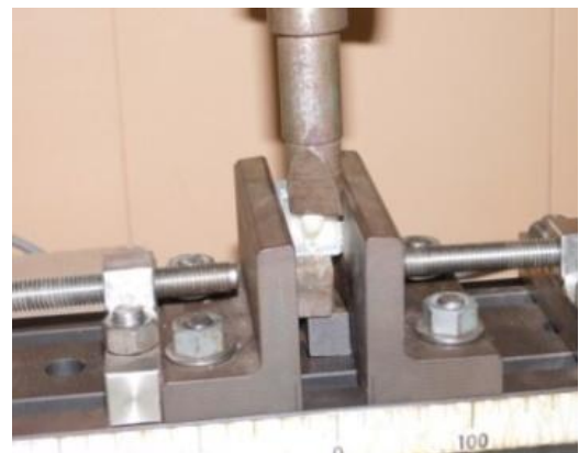
Fig4 Specimen Mounted for Shear Bond Testing