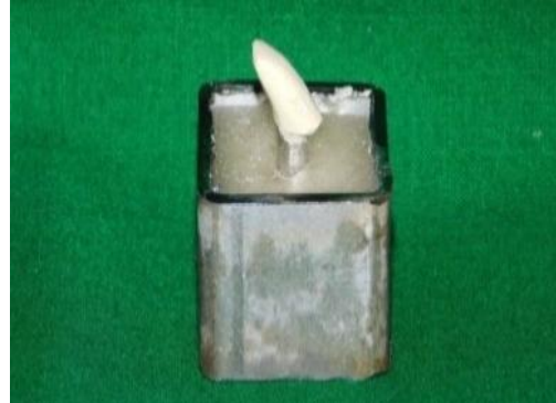
Fig 2 Mounted PEEK framework