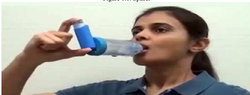
Spacer with MDI