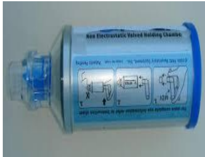
Figure 1.1: Spacer