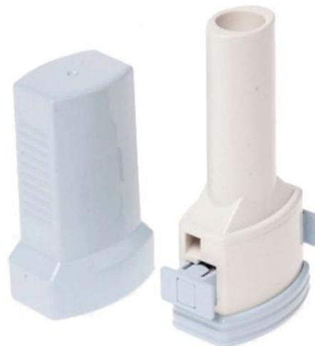
Figure 1.3: DPI (Aerolizer)