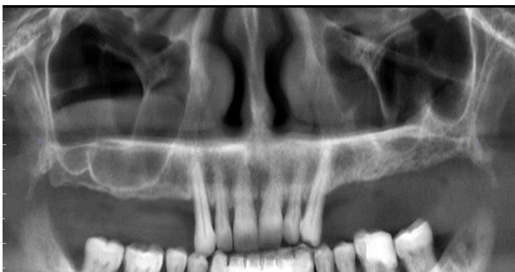
Figure 3: Radiographic pre-operative view.