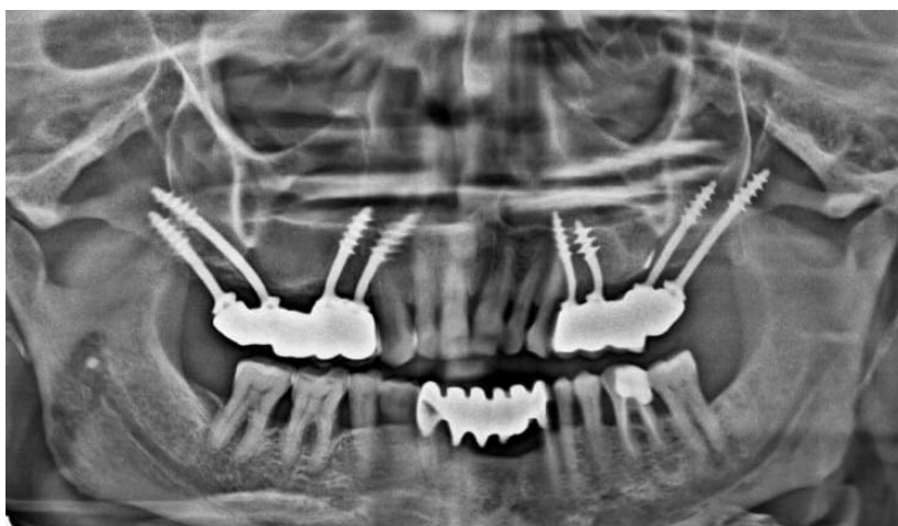
Figure 14: Post-operative radiographic view