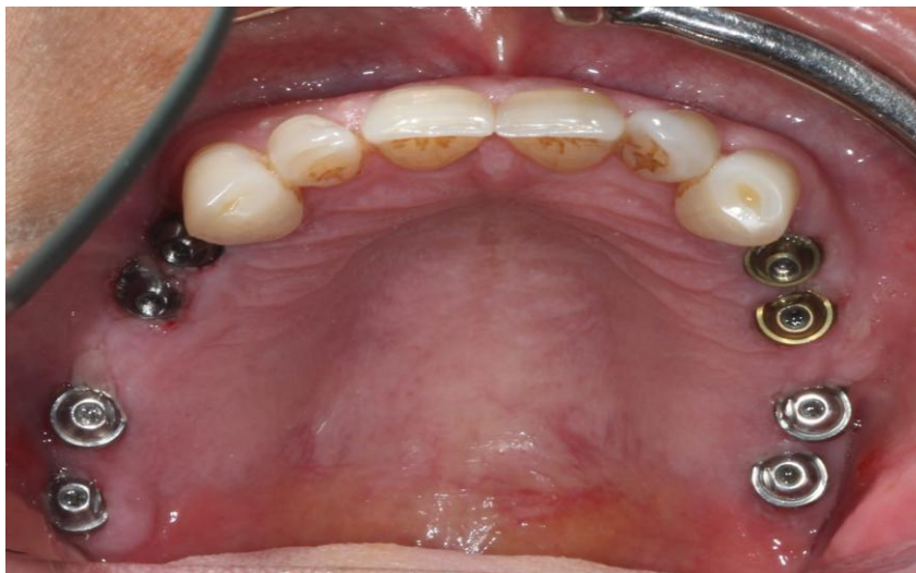
Figure 5: Implant placement