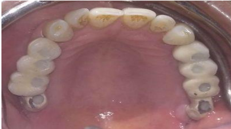
Figure 12: After sealing the holes in the prosthesis with Teflon and covering with composite material