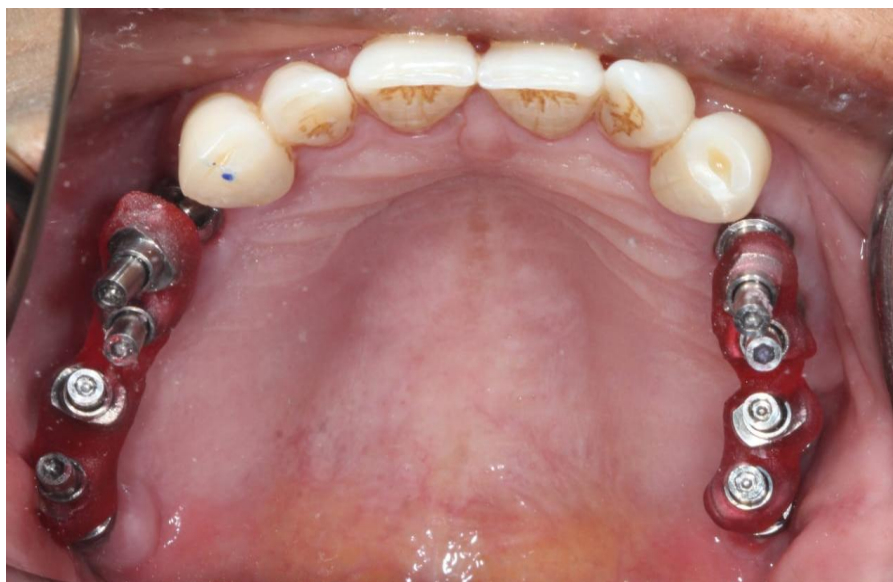
Figure 7: Impression post splinted with pattern resin and before pick-up impression