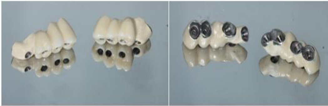
Figure 8 and 9: Screwable porcelain-fused-to-metal restoration (outer and inner view)