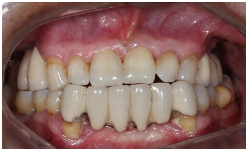
Figure 13: Post-operative view