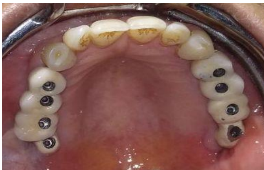
Figure 11: Final Prosthesis