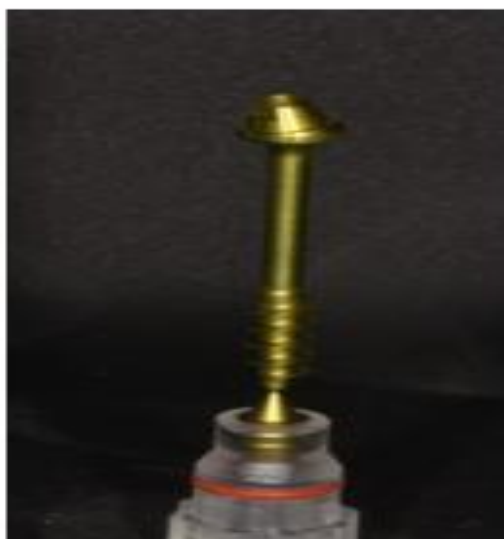
Figure 4: BECES® MU (single piece multi-unit) implant on the delivery holder