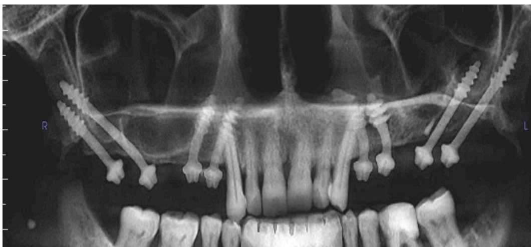
Figure 6: Radiographic view post implant placement.