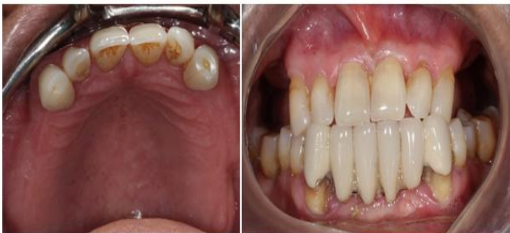
Figure 1 and 2: Clinical intra-oral examination. The lower jaw shows periodontal involvement but does not need immediate treatment or extraction. After this implant treatment the lower premolars and molars will be under regular functional load, which will increase chances for higher mineralization and prolong tooth survival.