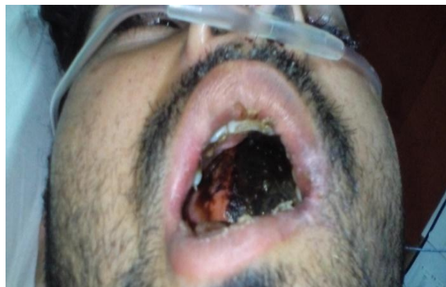
Figure 3 : palatal necrosis

On clinical examination the swelling was hard, generalized in the left check region and was febrile. On intraoral examination purulent discharge was present from the surgical socket and mucosal necrosis was present at the posterior region of hard palatal .(Fig. 3)with foul smell.