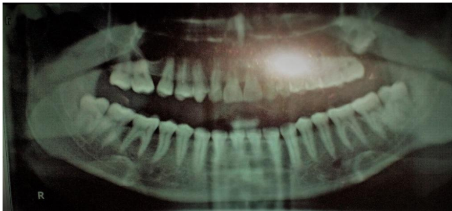
Figure 2 : showing impacted left maxillary third molar

Circum orbital edema was to a extent that the patient was not even able to open the left eye. Patient gives history of surgically extracted left impacted maxillary third molar in a local clinic one week ago. Preoperative OPG was available with the patient which was showing left impacted maxillary third molar.(Fig 2)