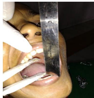
Figure 4: Mouth opening after one month