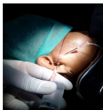
Figure 2: Intra-operative view