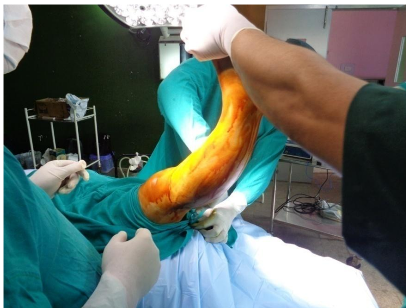
Fig 2: Painttinting before surgery