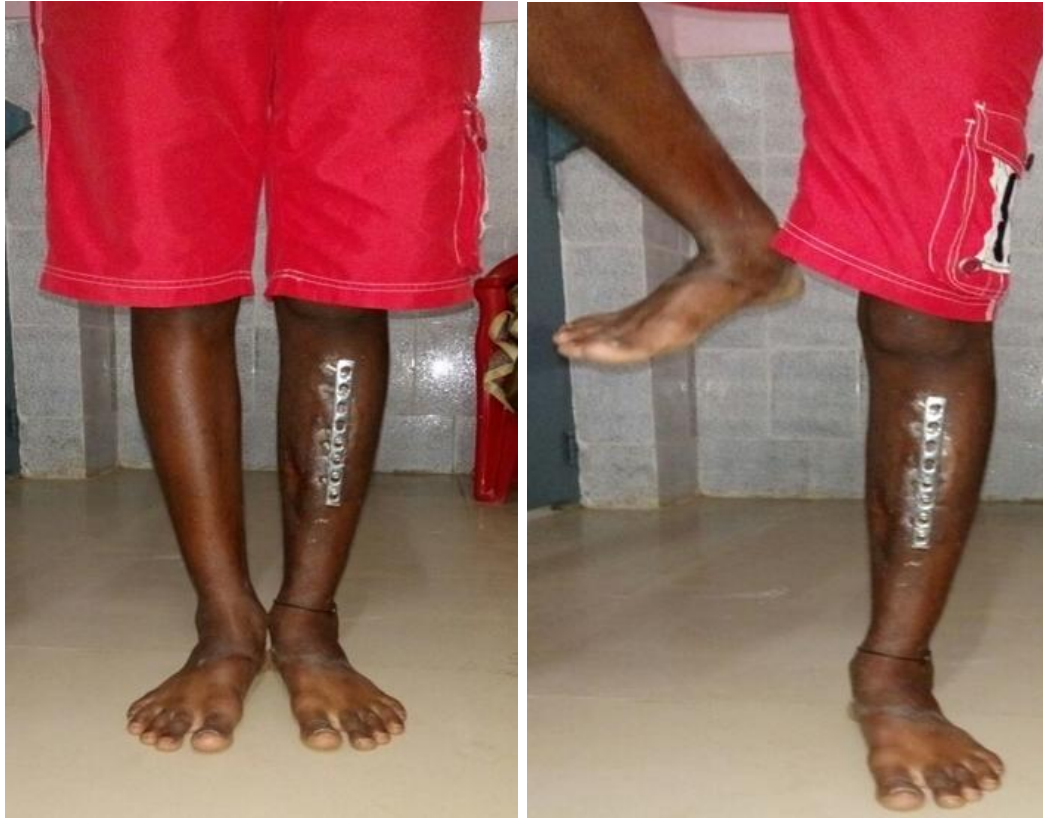
Fig 6: Unsupported full weight bearing at 12 th week