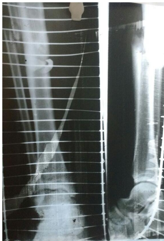
Fig 1: Preoperative X-ray of fracture shaft of tibia

Statistical analysis was done using SPSS software (version 21.0). Mean, standard deviation and the distribution of each variable was calculated.