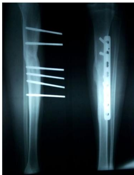
Fig 5: Radiological evidence of union with callus formation