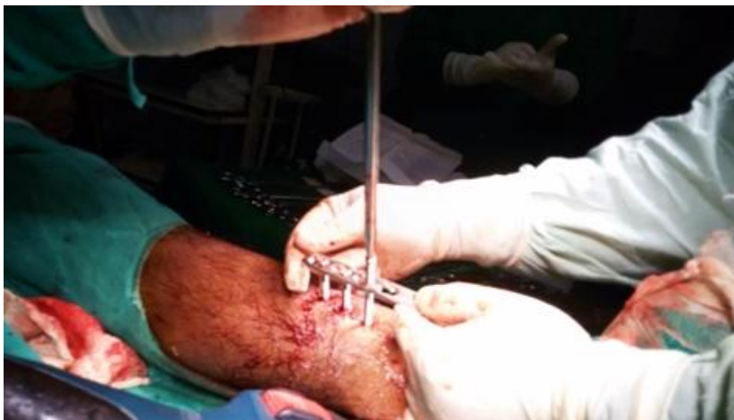
Fig 3: Introduction of screws through LCP after wound debridement and fracture reduction