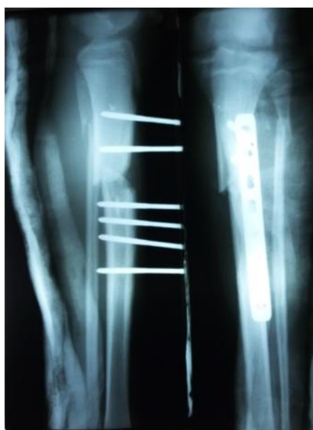
Fig 4: Post-op X-ray showing correction of length, alignment and rotation with rigid fixation.