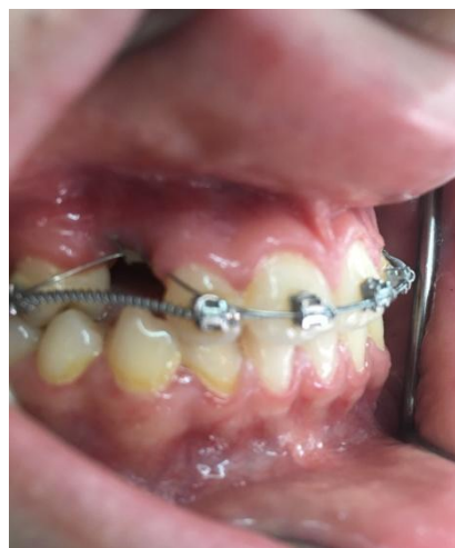
Picture no8: Traction of the impacted canines with double arch technique