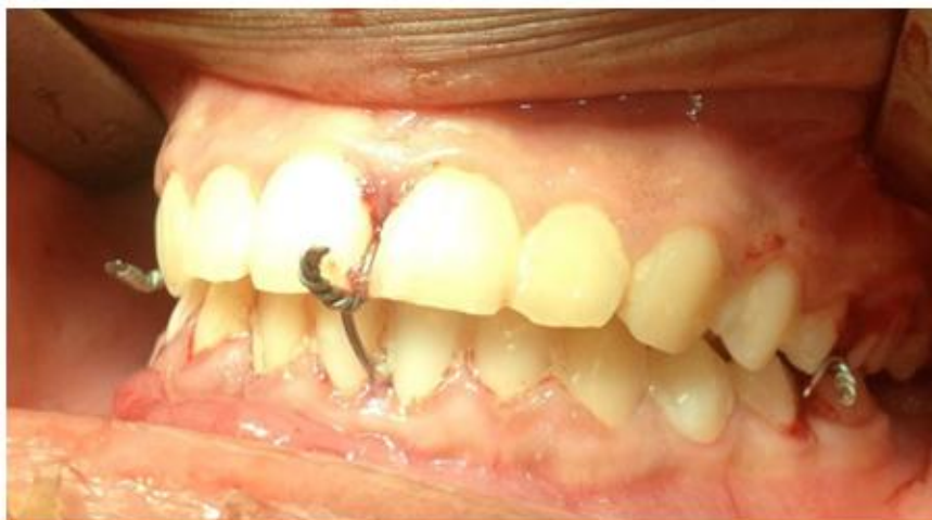
Picture 4 – Calibratinh steel wire application applied to midline to ensure stability

In some cases, it is possible to Pierce the gum with the wire through the middle line área what helps the intermaxillary blockade stability (Pic. 4).