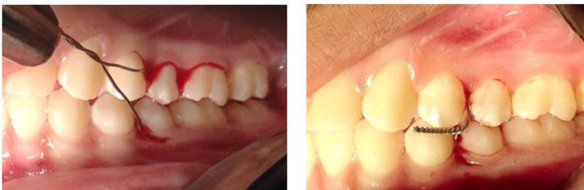
Picture 3A/B – Intermaxillary block in number 4 caliber interdental wire applied bilaterally

In some cases, it is possible to Pierce the gum with the wire through the middle line área what helps the intermaxillary blockade stability (Pic. 4).