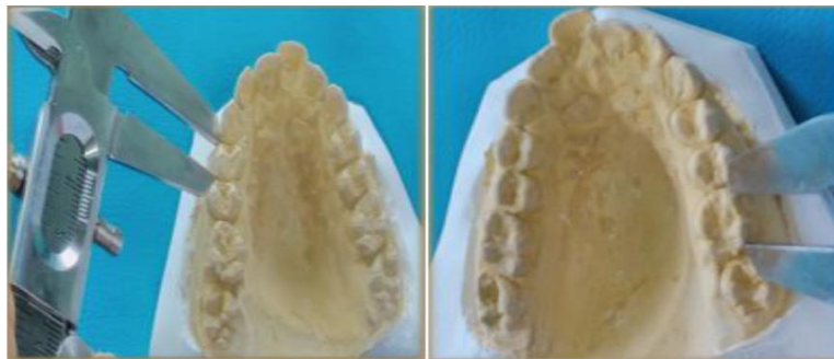
Fig 1 : measurements done between the highest points on the palatal surfaces of premolar and molar

The study was conducted in the Department of Oral Pathology & Microbiology, Government Dental College, Thiruvananthapuram. The study group comprises of 100 individuals (50 males and 50 females) in the age group of 17-21 years, who are of Kerala origin by birth and domicile, with fully erupted, healthy and non-worn dentition. Impressions of the dentition were made using alginate impression material and casts were poured immediately to avoid changes in dimension using Type IV dental stone. All the measurements were done using vernier callipers of resolution of 0.02mm. the distance between the highest points on the buccal/labial and lingual/palatal surfaces were measured and analysed.