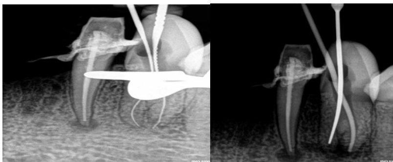
Fig 3: Radiovisiographic image of working