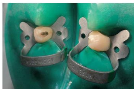
Fig 1: Access Cavity Preparation

A 32 year female patient reported to the department of prosthodontics for fabrication of crown with respect to right mandibular lateral incisor. She was sent to the department of conservative dentistry and endodontics for intentional RCT of right mandibular canine. Endodontic treatment was initiated after administering local anesthesia. Rubber dam was placed and endodontic access was performed with a round diamond point bur and EndoZ tapered safe end bur (DentsplyMaillefer, Switzerland). Negotiation of root canals was done with a size 10 K file. Cervical and middle third was prepared with SX file of ProTaper system (DentsplyMaillefer, Switzerland). Root canal length was determined with an electronic Apex Locator (Root ZX, J Morita, Japan) and reconfirmed radiographically. Biomechanical preparation was done up to ProTaper file size F1 using EDTA lubrication (RC-Prep, Dentalcompare, USA) under constant irrigation of 3% NaOCl and saline at each change of file. Obturation was performed using F1 ProTaper GP cones using AH Plus Sealer (DentsplyMaillefer, Switzerland). After 1 week, patient reported asymptotically and final restoration was performed