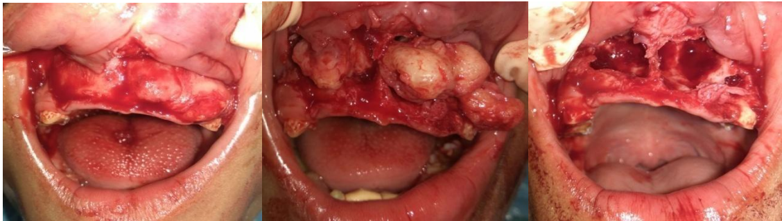
Figure 5A, 5B, 5C