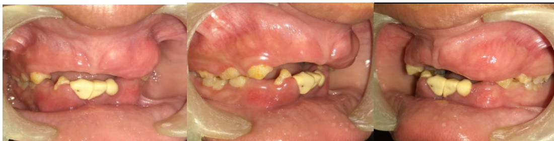
Figure 2A, 2B, 2C