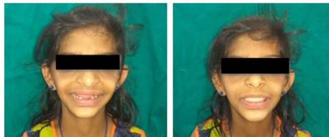
Figure 11A, 11B