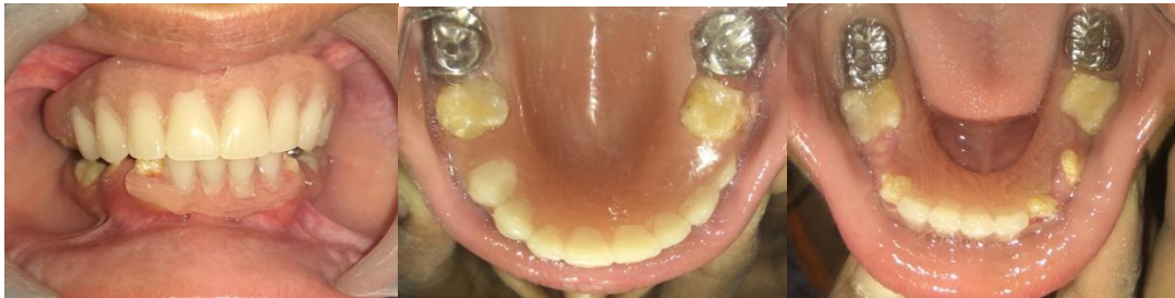
Figure 9A, 9B, 9C