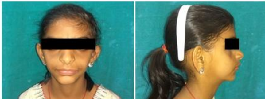
Figure 1A, 1B