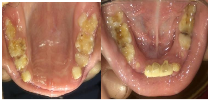
Figure 3A, 3B