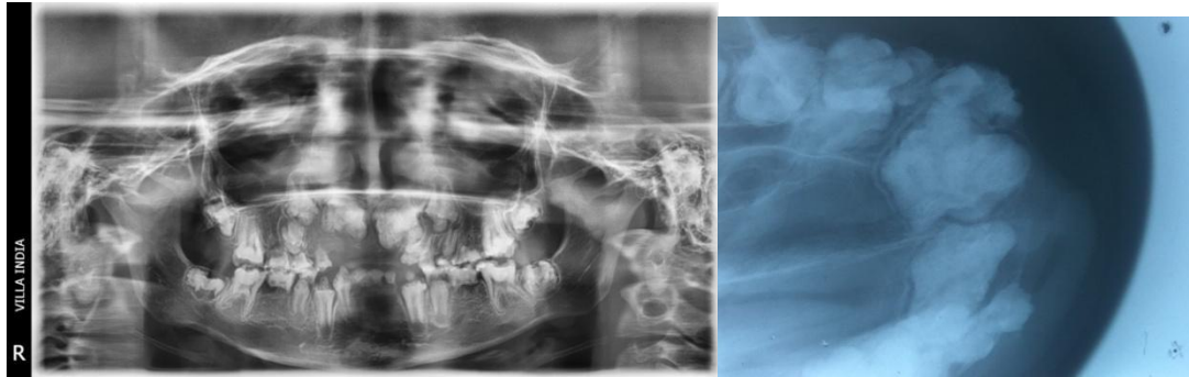
Figure 4A, 4B