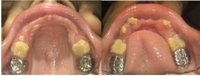
Figure 8A, 8B