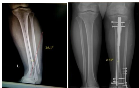
Table: 1 Case No.3