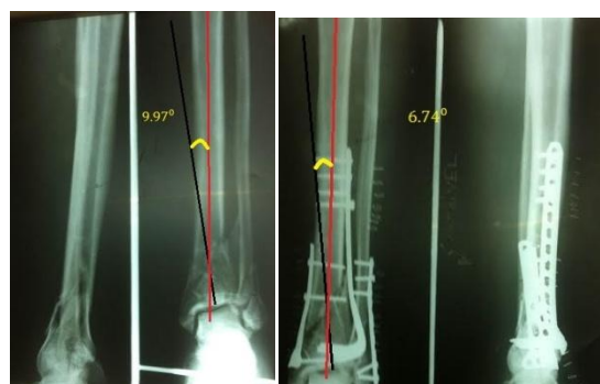
Table: 2 Case 7 Medial Lateral Plate