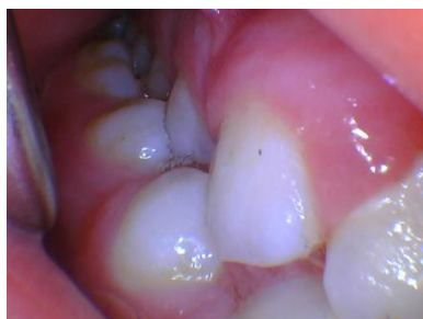
Figure no 4- Endo-oral examination: lateral inverse occlusion and rotated teeth

At dental level there are structural, shape changes, and also a reduction of the orolingual and mesiodistal dimensions. The dental elements have small dimensions due to the low enamel thickness. The final thickness of the enamel layer is marked by the secretory state of the amelogenesis. Haploinsufficiency of the AMELX gene suggests the damage of amelogenesis 19,20 .