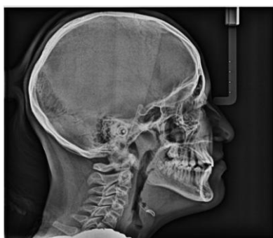
Figure no 5 Lateral cephalometry

Lateral cephalometry (figure no 5) was performed under standardized conditions, with teeth in centric occlusion.