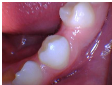
Figure no 2- Endo-oral examination: dental space - in lateral area

At the occlusion exam, there was found a lateral inverse occlusion (figure no 3) and a frontal occlusion (figure no 4), the medial mandibular line being diverted 4 mm to the left.