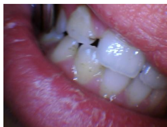
Figure no 3- Endo-oral examination: frontal inverse occlusion

At the occlusion exam, there was found a lateral inverse occlusion (figure no 3) and a frontal occlusion (figure no 4), the medial mandibular line being diverted 4 mm to the left.