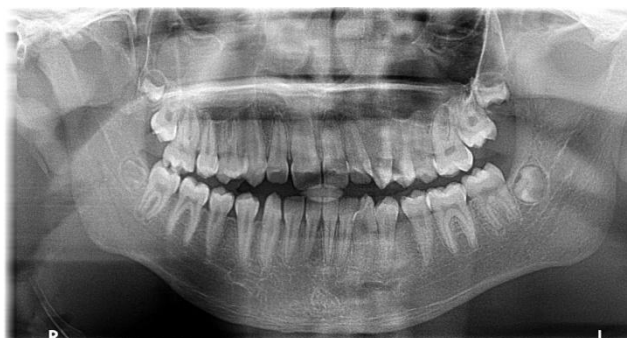
Figure no1 Radiographic aspects: class II of malocclusion, medial mandible line deviated 4 mm to the left Endo-oral examination revealed:

Exo and endooral examination was performed and the cephalic extremity was inclined to the left, facial asymmetry, mandibular and maxillary retrograde. It performed RX-OPT without showing signs of resorption of the teeth roots, class II of malocclusion, mandible median line deviated 4 mm to the left (figure no1, figure no 2). There are no studies to support the correlation between dental arch morphology, malocclusion and karyotype 2,3 .