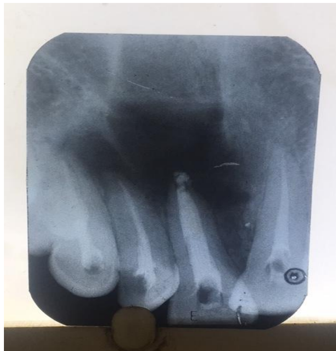
Figure 5: Immediate post operative IOPA

Patient was kept under proper follow up and healing was evident in radiograph taken ten months after the surgery. figure : 6.