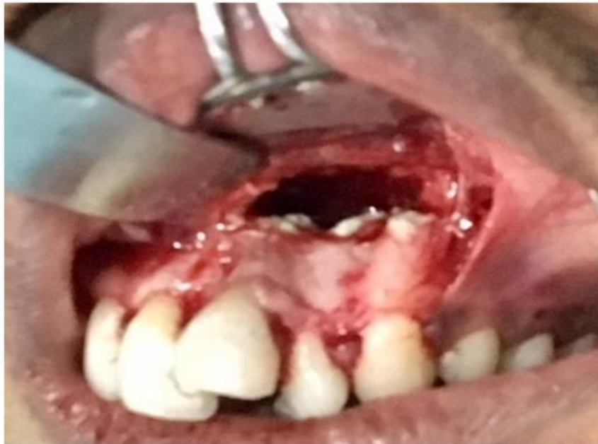
Figure : 3, Retrograde filling was done with Mineral trioxide aggregate

Retrograde filling was done with Mineral trioxide aggregate (MTA). Flap closure was done by 30 silk suturing. [Figure :4]