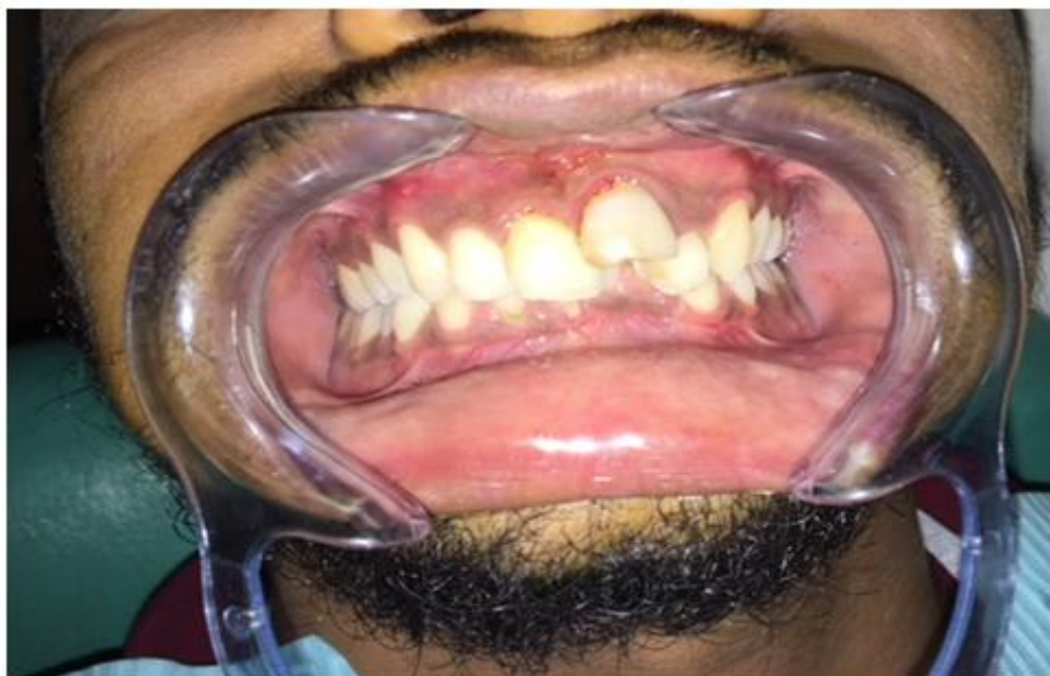
Figure 1: pre operative view

Clinical evaluation revealed that a greyish black discoloration was present in 21 tooth, which was labially erupted and an accessory mesiodens was present between 11 and 21 region.[figure 1]