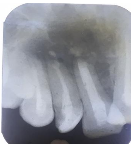
Figure 5: post operative IOPA after 10 months showing good healing