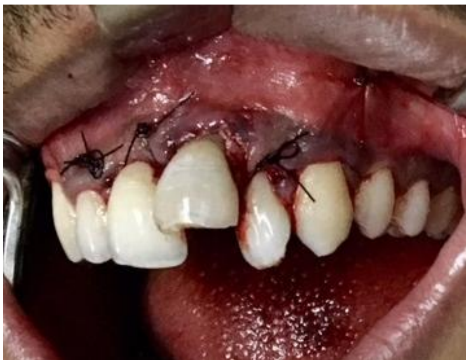
Figure 4: Flap closure