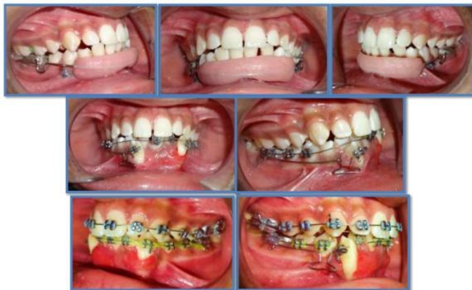
Figure 3b- treatment progress photographs: lipbumper to prevent soft tissue irritation and utilization of T loop for retraction of 43.