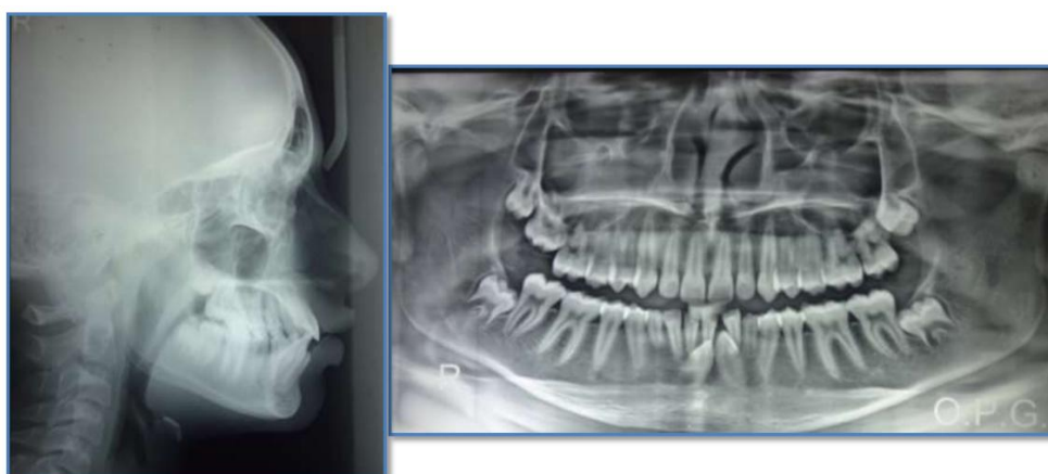
Figure 2- pre-treatment radiographs- lateral cephalogram and orthopantomogram