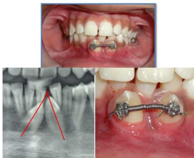
Figure 3a- treatment progress photographs: uprighting of canines by reciprocal action of open coil spring