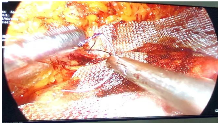
Fig 3 :- Shows mesh fixation.