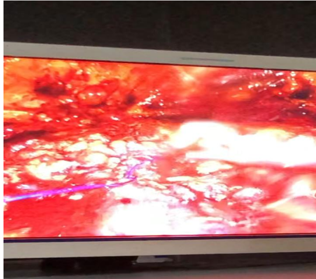
Fig 2 :- Defect closure with 2-0 prolene