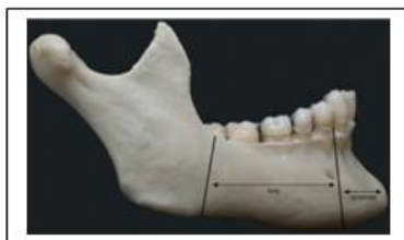
Anatomical interpretation of parasymphysis 14

Using the classification by Dingman and Natvig, 2 the region of the symphysis is bound by vertical lines just distal to the lower canine teeth. Fractures in this location are also commonly referred to as parasymphyseal. The region of the body comprises the mandible from the canine line to a line coinciding to the anterior border of the masseter muscle.