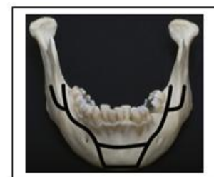
Champys osteosynthesis line 14