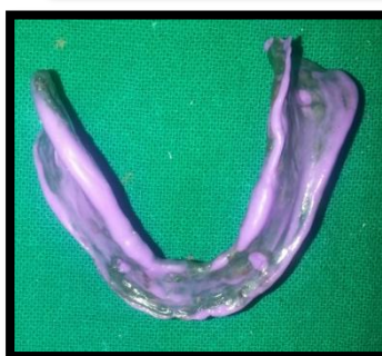
Fig. 1(e) Border moulding using All Green technique