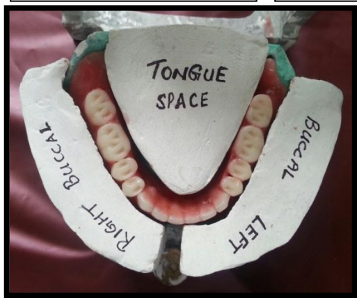
Fig. 2(c) Teeth arrangement within the confines of neutral zone