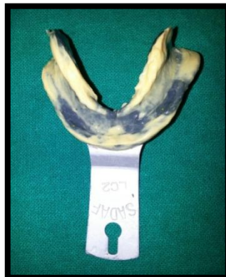
Fig. 1(c), 1(d) Preliminary impression using McCord's technique and refined using