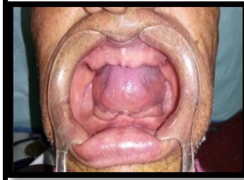
Fig.1(a), 1(b) Pre-rehabilitative extra-oral and intra-oral view