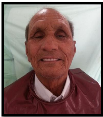
Fig. 2(d) Post-rehabilitative extra-oral view