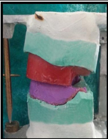
Fig. 2b Neutral zone recorded using piezography