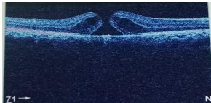
Fig1: OCT-3D Macula, right eye of 35-year-old male showing full thickness macular hole.