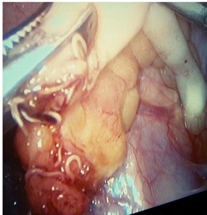
Figure No 1 worms with appendix (laparoscopic view)