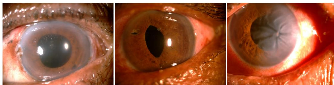
Figure 3: Complications following Iris claw implantation A: Corneal edema, B: Ovalization of pupil, C: Striate keratopathy

Ovalization of the pupil was seen in 10 cases. (Figure 3)