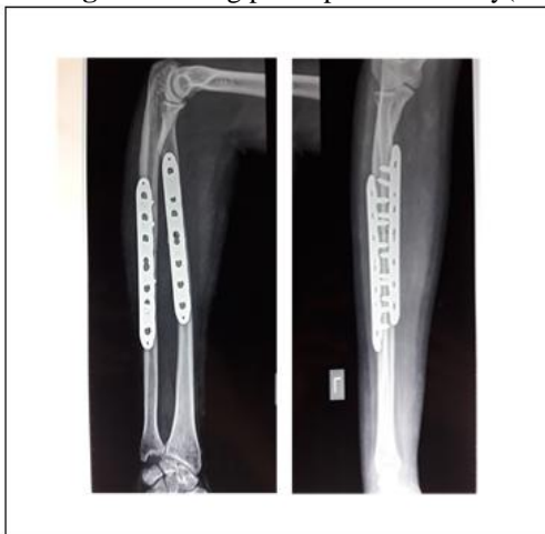
Fig 3: Showing post-operative X-Ray(LCP)