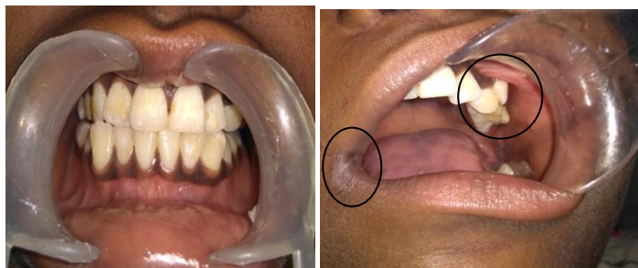
Figure 4: intraoral examination showing dental transposition and angular cheilitis