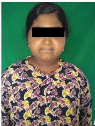
Figure 2: Typical features of Cushing's syndrome.

She was conscious and well oriented and was having pallor in eyes with bilateral non-pitting pedal edema with inability to pinch the skin over dorsum of feet. There was no history of icterus, clubbing, cyanosis or lymphadenopathy. On clinical examination; child had moon facies, buffalo hump, short neck, angular chelitis, short finger and toes, short hands and feet with pale patchy nails (fig.2). Scalp showed crusted scaly plaques on sides. Upper limbs and thighs showed discrete minimally scaly plaques.