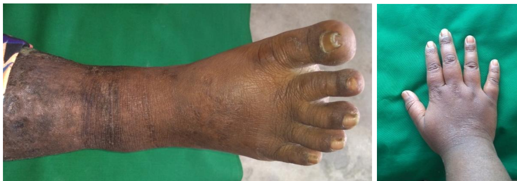
Figure 3: Non-healing ulcer on legs and pale patchy nails.

There were xerosis and scaling on the trunk and proximal limbs with follicular prominence. Hyperpigmented plaques circumferentially involving both the legs were noticed. Also there were multiple irregular ulcers of size 1-2cm on the left leg with yellowish slough and serous ooze from these lesions (fig.3).