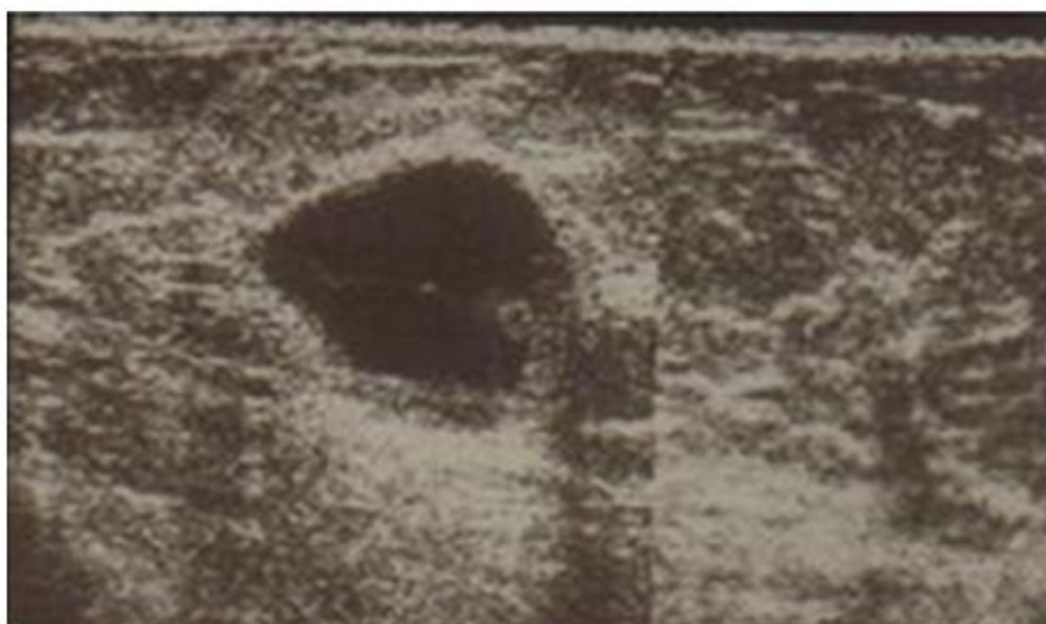
Figure 2 USG of right breast showing a cystic lesion

Specimen (Figure 3) was sent for histopathological examination. Specimen received was 5x3 cm and was lipomatous. The cut section showed cystic structures measuring 5x3cm filled with serosanguinous material. Permanent sections revealed a dilated duct with papillary structures protruding into the lumen. These papillary structures had fine fibrovascular cores and were covered with multilayered cells showing prominent nuclear pleomorphism and brisk mitotic activity (Figure 4).