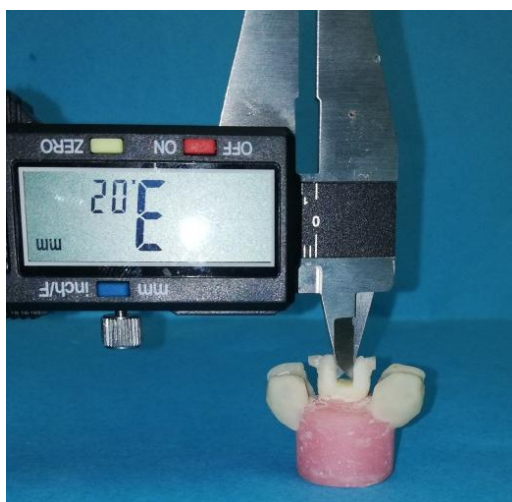
Figure (1) The bucco-lingual width of the cavity 3 mm verified by using the NEIKO electronic digital caliper.

After this procedure, the restored teeth were mounted to a stainless steel cylindrical mold filled with rubber base material to act as peridontium medium surrounding natural teeth, then teeth were subjected to a maximum vertical load 5 of 1 Kg with cyclic frequency of 1 Hz for 50000 cycles (24) . The third reading between the two reference points were recorded after thermo cycling and load cycling procedures.