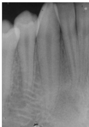
Figure 4. Radiograph obtained 6 months after surgical intervention

Six months after the surgical intervention a new radiograph was taken (Figure 4), which revealed a slightly radiopaque area, a finding indicating new bone formation.