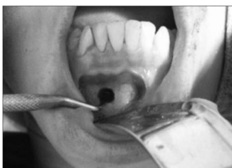
Figure 3. Transsurgical aspect

On the basis of the findings, surgical treatment was indicated. No cellularized lesion or cystic content was observed during the surgical procedure, with the observation of a clearly visible cavity with intact bone walls which led to the diagnosis of traumatic bone cyst (Figure 3).