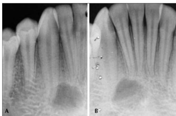
Figure 1 (A and B). Preoperative radiographic aspects

Clinical examination showed no swelling or other significant sign in the area. Radiographically, the lesion presented as a well-delimited unilocular radiolucent area in the periapical region of teeth 4.2 and 4.3. The lesion produced no resorption of the root or lamina dura and the teeth involved presented preserved pulp vitality (Figure 1 – A and B).