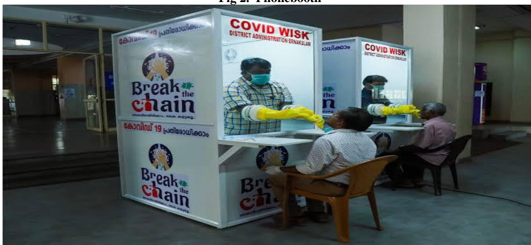
Fig 2. Phonebooth

Jharkhand has begun using the Phonebooth testing method to tackle this novel Coronavirus . This testing method involves collection of sample from inside a box of aluminium and glass .