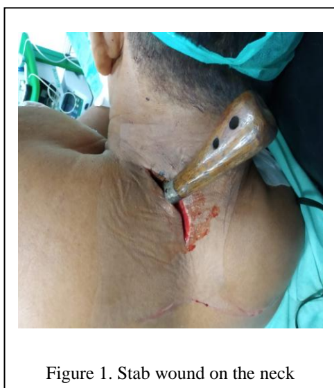
Figure 1. Stab wound on the neck