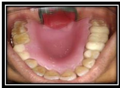
Fig 7 : Green stick compound is added to generate palatal lift

The oral portion of the appliance with loop is tried in and adjusted as necessary to ensure complete seating. Modeling compound is applied to the loop, shaped, flamed to create a smooth surface and then chilled before placing it into the mouth. If softened compound is placed in the mouth, the soft palate will displace it downward and the lift action will not occur. Displacement of the soft palate is the primary goal of the procedure and can be accomplished with hardened compound only. Small additions of green stick compound is made posteriorly until the soft palate is brought into light contact with posterior pharyngeal walls (Fig 7). Following each addition, the patient is asked to breathe through nose. Following lift generation session, the lift portion of the appliance is replicated in acrylic resin (Fig 8)