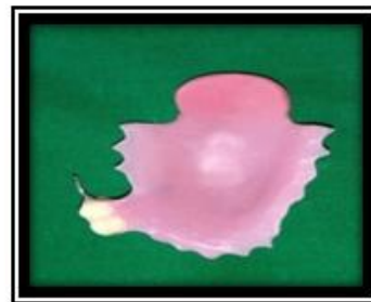
Fig 8: Impression compound replaced with acrylic resin