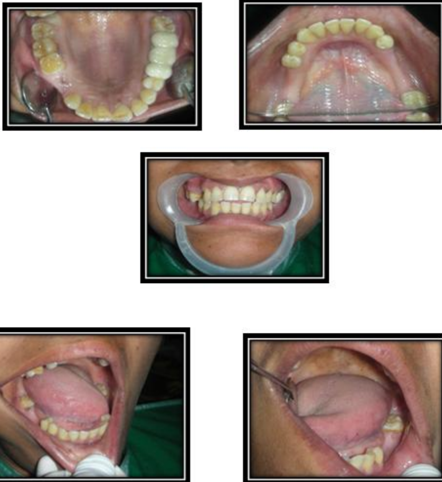
Fig 3: Intraoral View

On intraoral examination there is a FPD present extending from 15 to 17, Missing 24, 25, 36, 37, 45, 46 and 47. Patient has an open bite. Indentations present in the lateral borders of tongue.