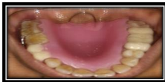
Fig 6: Treatment Partial denture with retentive loop

A treatment partial denture is fabricated for both maxillary and mandibular arch