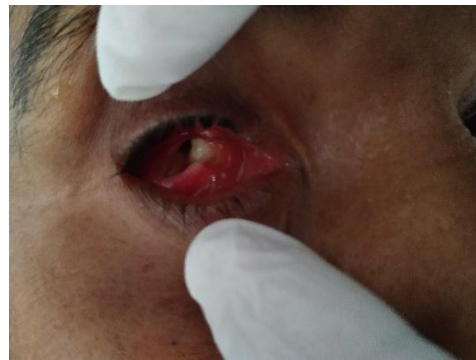
Fig 2: Enucleated right eye