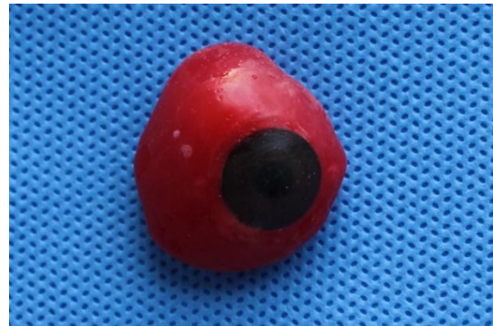
Fig 12: Completed wax pattern of ocular prosthesis with iris