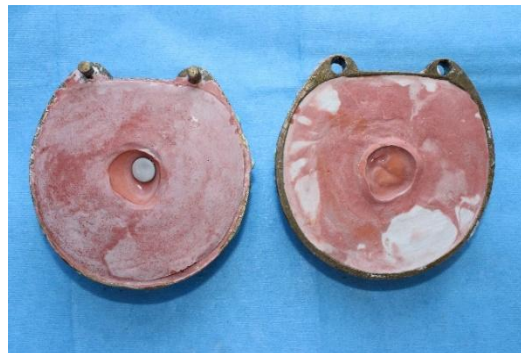
Fig 14: After dewaxing