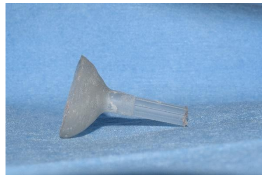
Fig 6: Acrylic stock tray