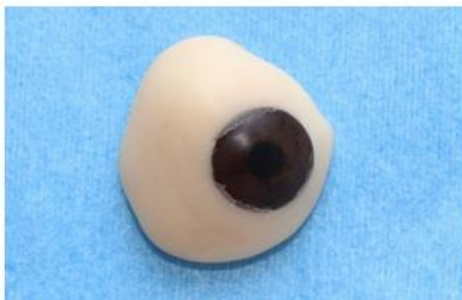
Fig 15: Finished prosthesis before characterisation