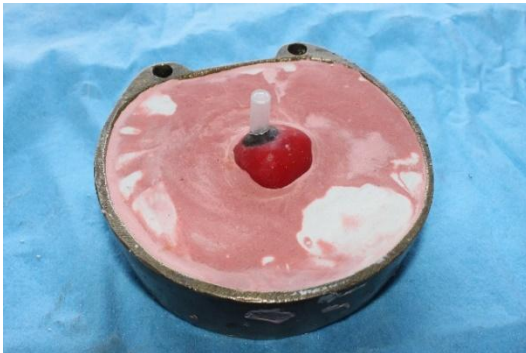
Fig 13: Needle hub positioned