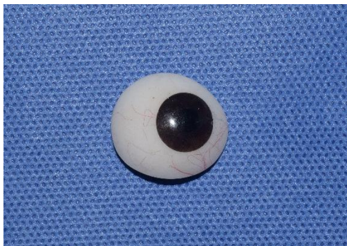
Fig 3: Stock eye