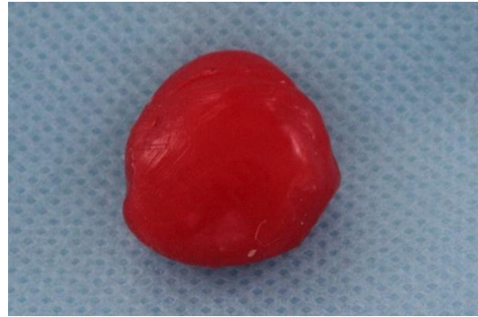
Fig 10: Wax pattern