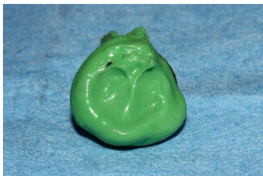
Fig 7: Impression of eye socket