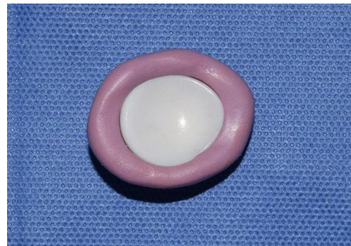
Fig 4: Putty Index