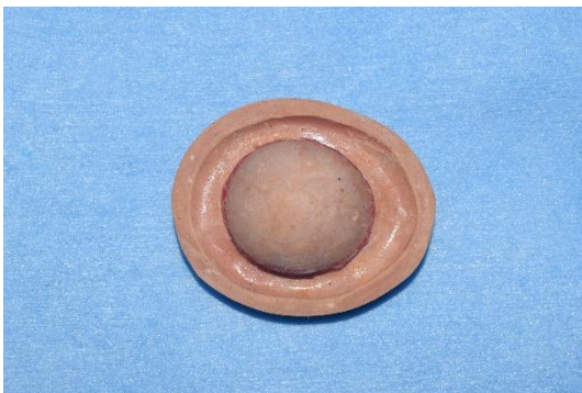
Fig 5: Die stone mould