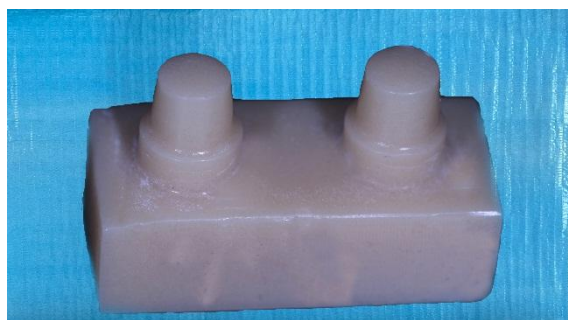
Fig.1: PMMA model

The stainless-steel dies were sprayed by protechno; the model was placed in Dof swing scanner optical scanner. After optical scanning of stainless-steel model, the software design (Dental DB2.2 Valletta)* were transferred to milling machine (Arum 5x-400) (fig.1) .