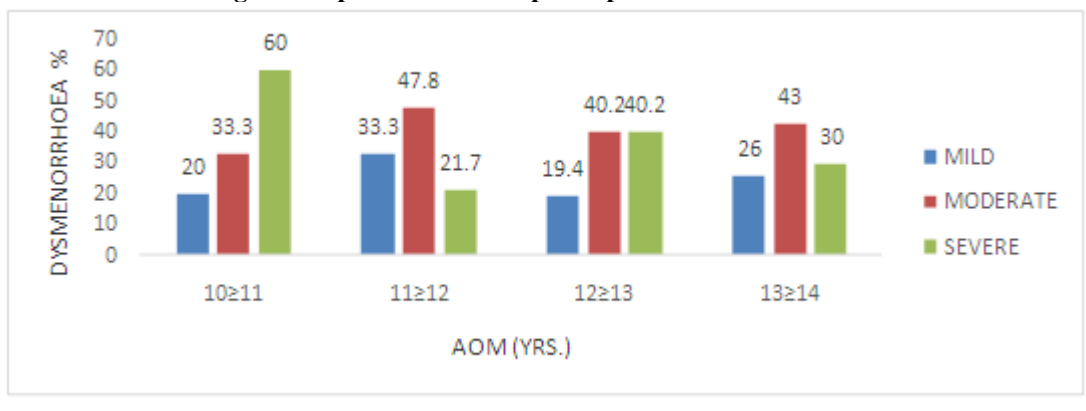
Fig 3: Comparison of PD in participants of different AOM

The prevalence, severity and MPS of PD was highest in girls who attained an early menarche ( 10 \ge 11 yrs.) and gradually reduced as the AOM increased. The percentage of girls suffering from severe PD was higher in the participants who attained menarche earlier (( 10 \ge 11 yrs.) as depicted in Table 5 and Fig. 3. but the difference in severity was not statistically significant. \chi^2(6.147) = 1.41 , p=0.96.