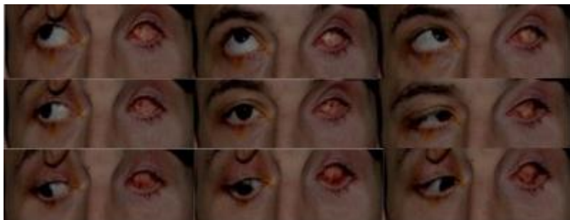
Figure 3 :The nine gazes positions without prosthesis