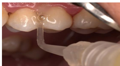
Figure (1): application of LS gel using a plastic blunted tip

Gingival crevicular fluid sample collection: GCF samples were taken at baseline, 1 month, and 3 months after therapy. The GCF sample was collected by inserting periopaper (Oralflow Inc., Smithtown, NY, USA) parallel to the long axis of the tooth, into the sulcus/pocket for 30s until a minimal resistance was felt. Periopaper strips visually contaminated with blood and saliva were discarded. Level of nuclear factor kappa b in GCF samples will be determined by using a commercially available means of Enzyme Linked Immune sorbent Assay (ELISA) ( Escobar et al., 2018 ).