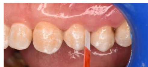
Figure (2): Insertion of a periopaper strip parallel to the long axis of the tooth, just 0.5 mm into the sulcus, and kept for 30 seconds for GCF sample collection

Clinical assessment: The periodontal conditions of each patient were evaluated at baseline and after 3 months follow-up. Plaque Index (PI) used to assess plaque accumulation around gingival margin. Mean Sulcus Bleeding Index (SBI) used to assess gingival inflammation. Probing Depth (PD) and Clinical Attachment Level (CAL) were measured by the University of Mish O'probe with Williams' graduations. The Occlusal stent was used as an auxiliary tool for the proper placement of the probe.