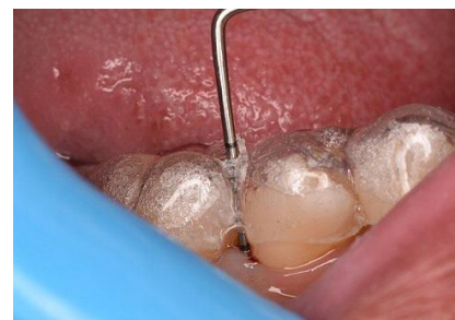
Figure (3): Measurement of probing pocket depth equal to 5mm using the University of Mish O'probe with stent placement