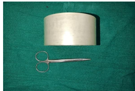
Fig 2: Cellophane strip and scissor