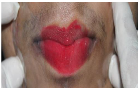
Fig 3: Cellophane strip applied on patient to obtain lip pattern