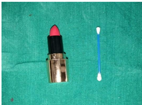
Fig 1: Lip stick and Ear bud

Data was analyzed using SPSS (statistical package for social sciences) version 20 (SPSS Inc., Chicago, IL). Pearson Chi-square test was used to ascertain the significance of differences between the variables. The level P < 0.05 was considered as the cutoff value or significance.