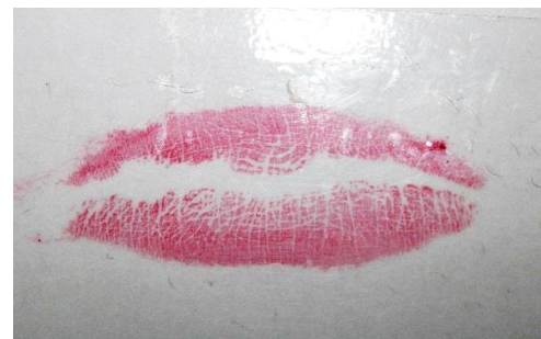
Fig 4: Lip print pattern obtained