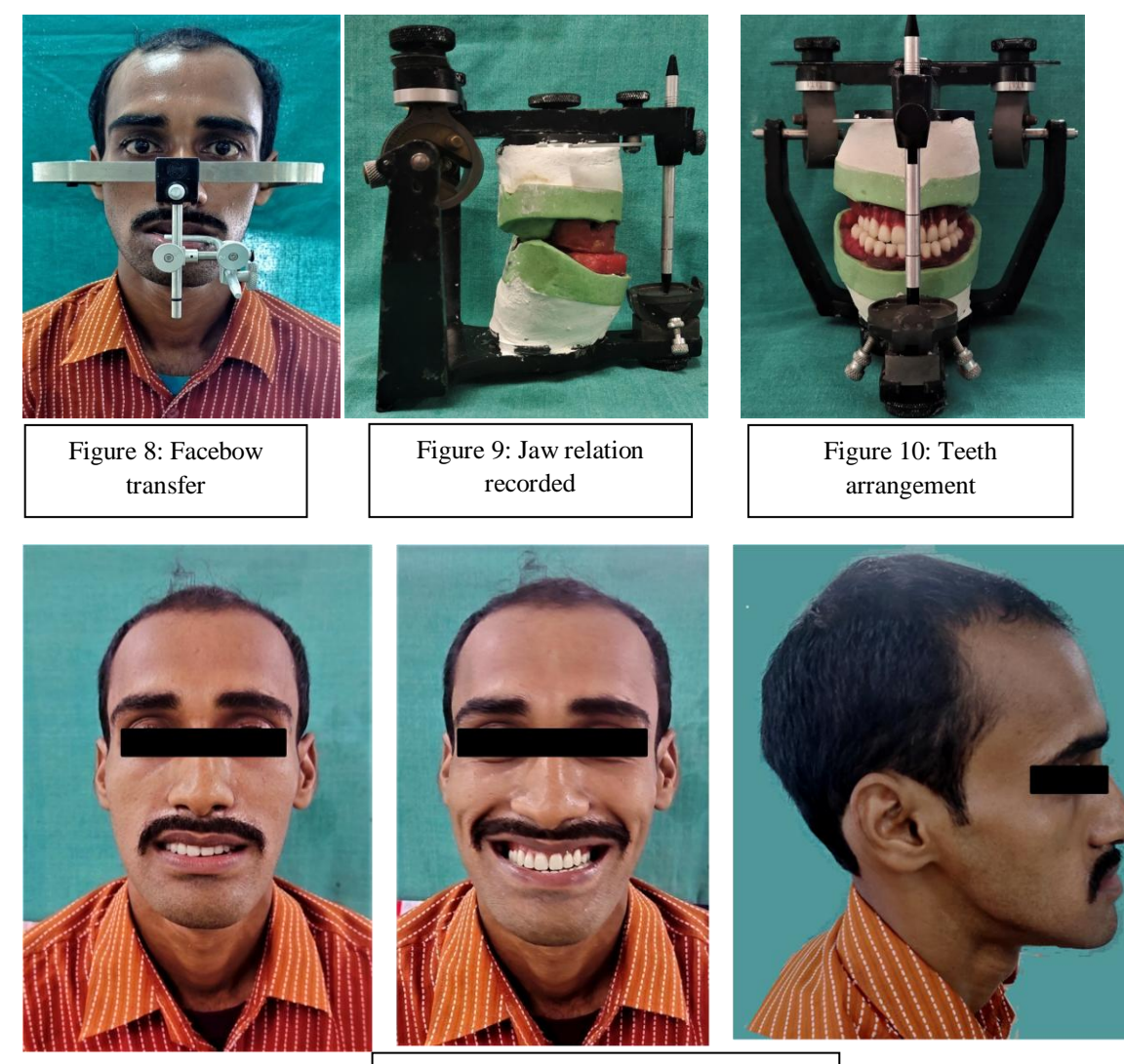
Figure 11: Post operative extraoral frontal and profile view