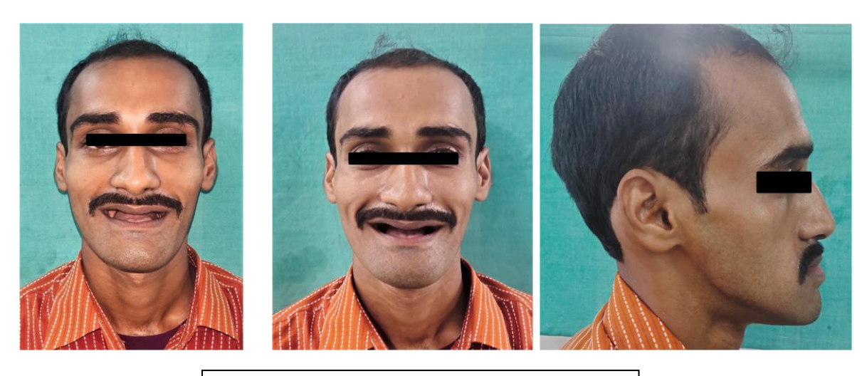
Figure 4 (b) : Extraoral view after root submergence