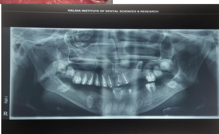
Figure 1(c): Pre-operative OPG