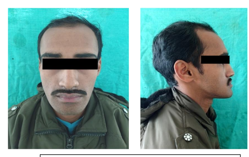
Figure 1(a) : Pre-operative extraoral frontal and profile view