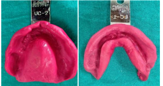
Figure 5: Primary impression of maxillary and mandibular arches