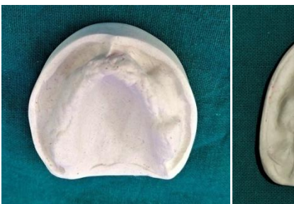
Figure 6:Diagnostic casts

Figure 5: Primary impression of maxillary and mandibular arches