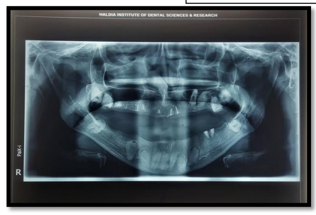
Figure 3: Post root submergence OPG