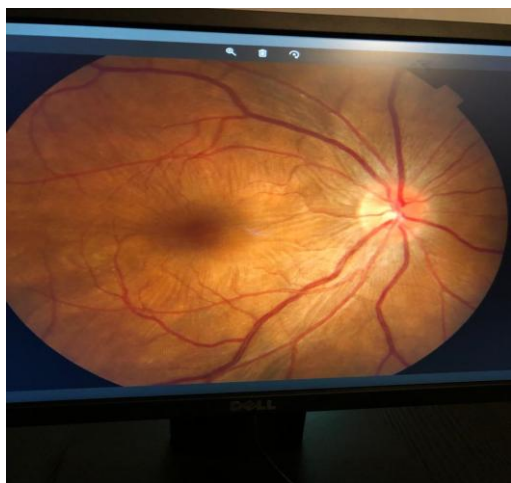
Figure 1. RIGHT EYE

LE: Papillar oedema 1,depigmented aspect of pole post; retinal folds