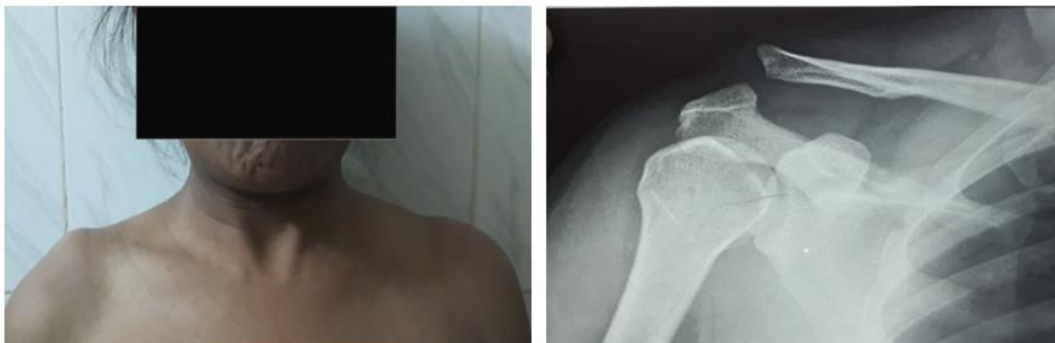
Pre-operative clinical and x-ray image of right sided AC joint dislocation

There was no intra-operative and immediate post-operative complication. Late complications encountered are 2 case of superficial incision site infection which was treated with oral medication and have favorable outcome, and on assessment at 48 weeks 1 patient was found to have subacromial osteolysis which was improved after removal of the plate.