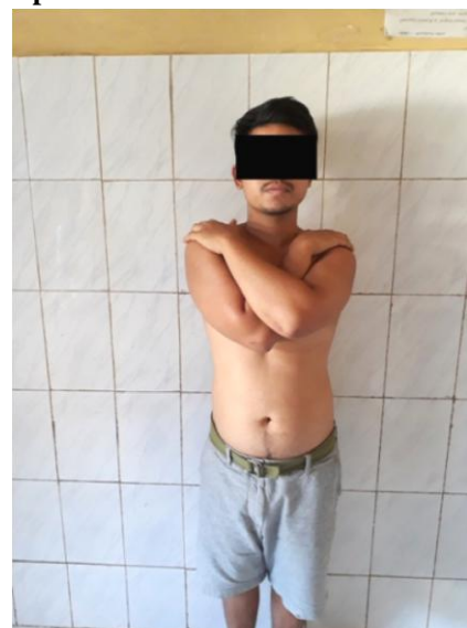
Images showing examination of patient with right AC joint dislocation treated with hook plate fixation, after removal of hook plate.