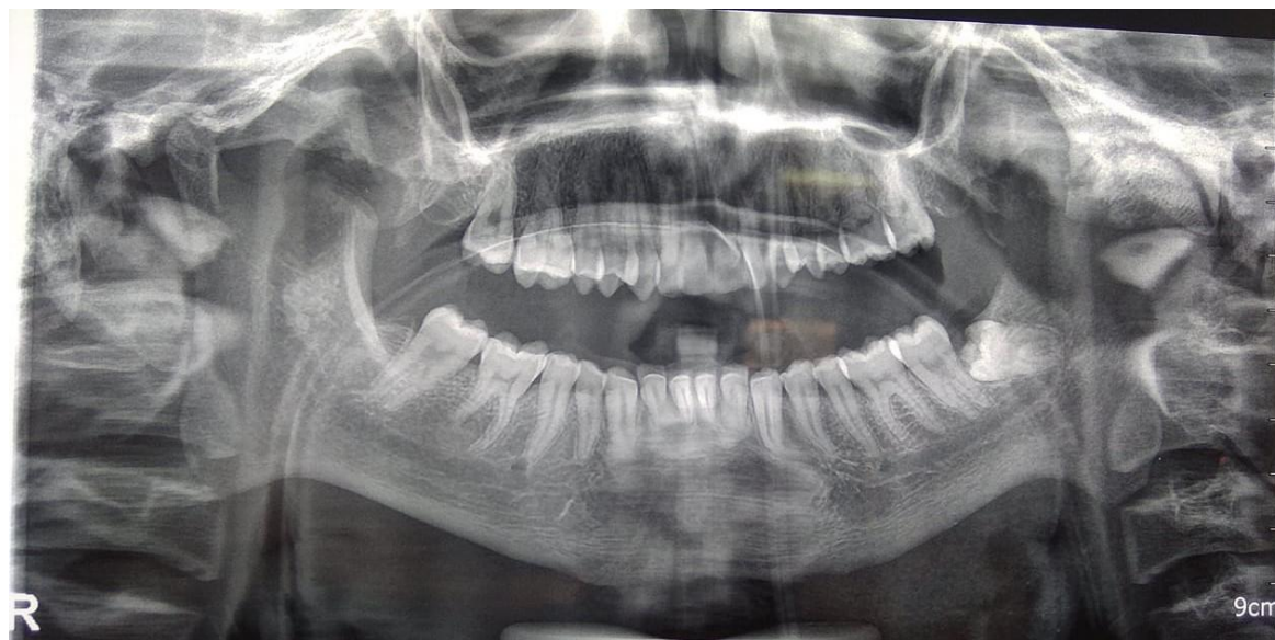
Fig 6. Post surgical OPG