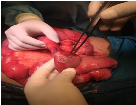
Figure 4: Ileal Perforation in a 16 year old male due to RTA