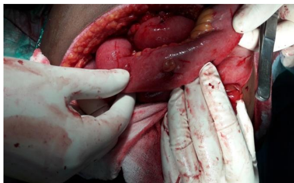
Figure 3: Jejunal Perforation in a 20 year old male due to RTA