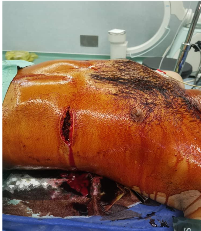
Figure1:Penetrating wound in left thoracoabdomen

Her blood pressure was 90/60 and heart rate was 110. We bring him to operation room and located a chest tube because of respiration distress. Then we explore the wound and find diaphragm and pericardium perforated.