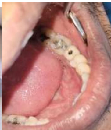
Figs. 18&19: final prosthesis