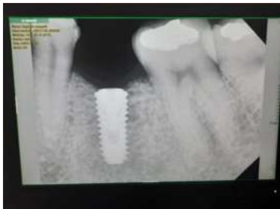
Fig. 9: Implant placed