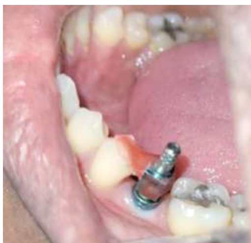
Fig. 16: fit checked intraorally