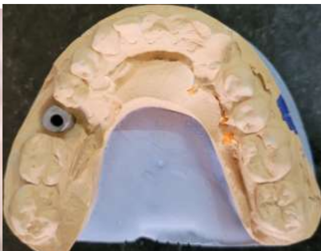
Fig. 17: metal try in