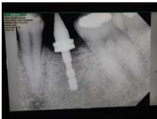
Fig. 7: Direction of the initial drill