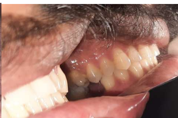
Fig. 2: Crown Height Space for restoration

Radiographic evaluation Cone Beam Computed Tomography (CBCT) showed the feasibility of implant placement in the edentulous site. It revealed thick cortical bone and adequate cancellous bone of type 3 quality in the molar area based on the classification of Lekholm and Zarb and no remarkable alveolar ridge resorption. The edentulous ridge was measured and it was suitable for adequate dimensions of a molar. The mandibular canal was placed off-center buccally of the mandible buccolingually and in the inferior 1/3 of the mandible