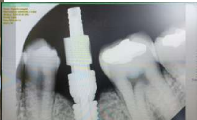
Fig. 15: Radiographic evaluation of fitting