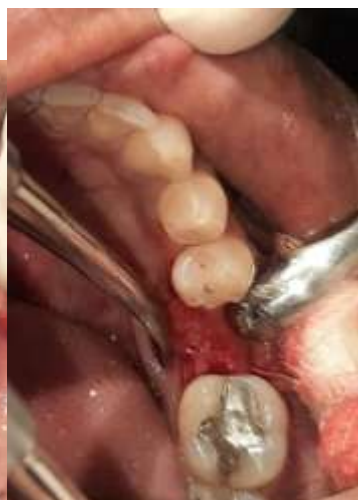
Fig. 6: Flap raised