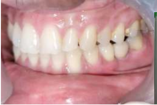
Fig. 20: In-Occlusion