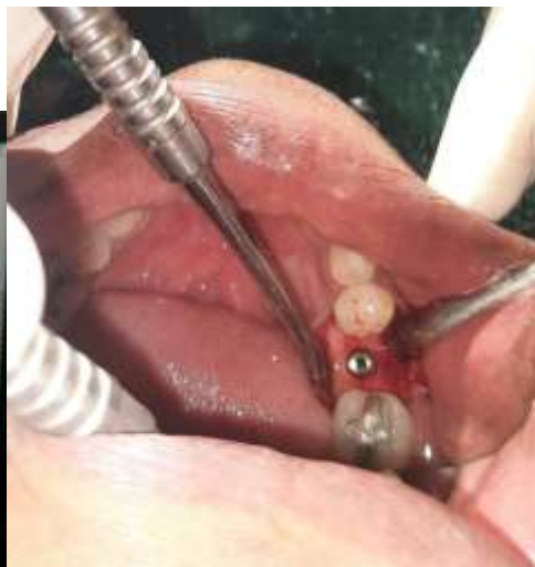
Fig. 10: Cover screw placed

As aesthetic was not a concern, provisional restoration was not given. One week post implant placement, sutures were removed and peri-implant tissues health was ideal. During the healing period, the patient did not express discomfort or neurological symptoms. Peri implant bone was also subsequently monitored by radiological evaluation. Osseointegration was excellent and no bone resorption has been observed around the implant.