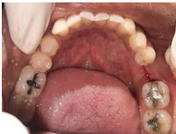
Fig. 5: Crestal and sulcular incision

After administration of local anesthesia with a 2% lignocaine hydrochloride solution containing adrenaline at 1:80000mg, a flap was raised. Crestal, sulcular incisions were given (fig. 5&6). When drilling the implant site, a direction indicator was used to check the orientation of the fixture. An implant fixture (diameter 4.5 mm; Length 10 mm) was then placed (fig. 7,8,9&10). Initial stability was good (20 Ncm torque).