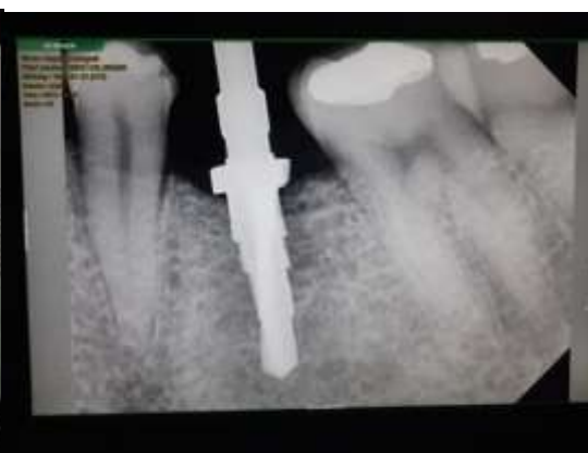
Fig. 8: Final drill