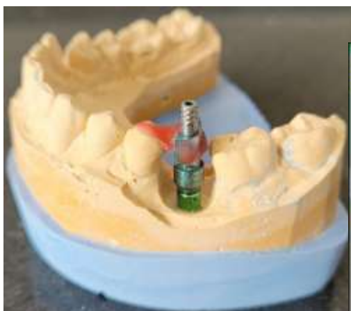
Fig. 14: Jig trial fabricated

A jig trial was fabricated and tried, which fitted perfectly(fig. 14,15 &16).Then an abutment was selected and prepared according to the adjacent and opposite teeth. A metal trial was fabricated over it and tried in the patient's mouth(fig. 17). The fitting was evaluated and a final restoration, which consists of metal ceramic crown, was fabricated(fig. 18&19). The fit was checked, and occlusion was adjusted for axial loads, by using articulating paper(fig. 20). A post-operative radiograph was taken after delivery of the final prosthesis(fig. 21).