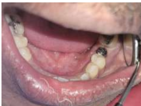
Fig. 11: Healing abutment placed

After 3 months of healing and management of peri-implant soft tissues, a healing abutment was placed by giving only a small crestal incision (fig. 11)