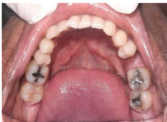
Fig. 1: Pre-op condition of patients arch

A 37-year-old male patient, with missing mandibular first molar, was reported to the department of prosthodontics after extraction. He expressed his wish for a minimally invasive treatment approach. Comprehensive examination revealed that an extraction treatment was done with respect to 36, due to caries and non-salvageable tooth structure, three months prior. The adjacent teeth are vital, with amalgam fillings placed in them, with a suitable crown volume and height. Oral hygiene was evaluated as good. (Fig.1&2)