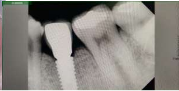
Fig. 21: Final prosthesis radiograph

After prosthetic treatment was completed, a follow up program was carried out for the patient. It offers the opportunity to examine the patient every 6 months in the first year and every 12 months in subsequent years.