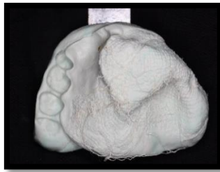
Figure 2a:- Primary Impression

Before Making Primary Impression The Internal Defect Was Covered With Adequate Gauze Piece. Preliminary And Final Impressions Were Made And Casts Were Poured Out Of Type 3 Dental Stone Respectively (Fig:2a, 2b, 2c, 2d )