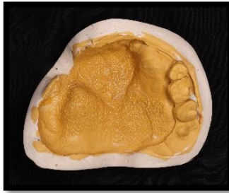
Figure 2b:- Primary Cast