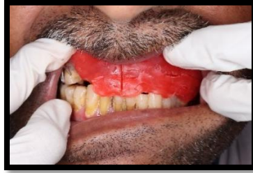
Figure 3:- Jaw Relation Recorded( Frontal View)

Self-Curing Resin Was Used To Make Denture Base, Onto Which Occlusal Rims Were Fabricated For Recording Jaw Relation (Fig:3).