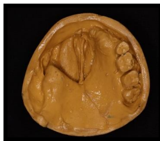
Figure 2d:- Final Cast