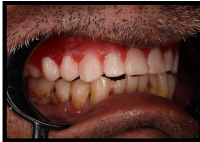
Figure 4b:- Final Denture Try-In (Right Lateral View)