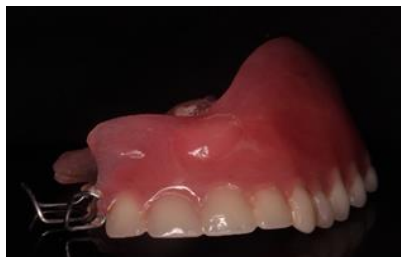
Figure 5a:- Final Prosthesis (Frontal View)