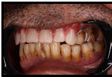
Figure 4c:- Final Denture Try-In (Left Lateral View)

The Final Prosthesis Then Was Fabricated Using Heat Cure Acrylic Resin (Lucitone) (Fig:5a,B).