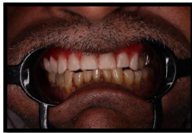
Figure 4a:- Final Denture Try-In (Front View)

After Choosing The Proper Teeth Size, Teeth Setting Was Done Followed By Denture Try-In(Fig:4a,B,C).The Trial Denture Was Confirmed Intraorally And Occlusion Was Checked.