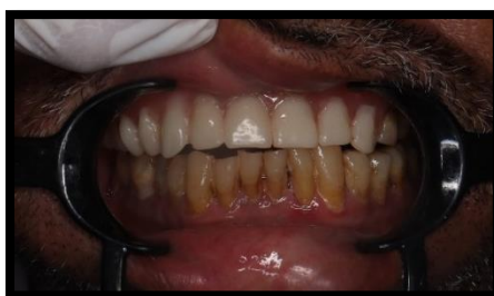
Figure 6:- Final Prosthesis (Intraoral Frontal View)

In Order To Ensure Retention, Stability, Occlusion, And Peripheral Seal, The Final Prosthesis Was Intraorally Inserted And Checked(Fig: 6).