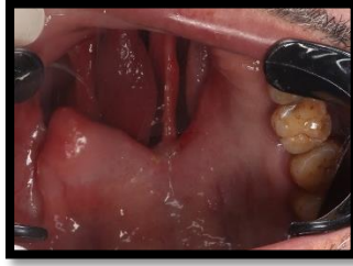
Figure 1:- Intraoral View Of The Maxillary Defect

Before Making Primary Impression The Internal Defect Was Covered With Adequate Gauze Piece. Preliminary And Final Impressions Were Made And Casts Were Poured Out Of Type 3 Dental Stone Respectively (Fig:2a, 2b, 2c, 2d )