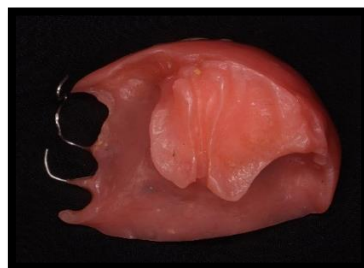
Figure 5b:- Final Prosthesis (Intaglio Surface)

In Order To Ensure Retention, Stability, Occlusion, And Peripheral Seal, The Final Prosthesis Was Intraorally Inserted And Checked(Fig: 6).